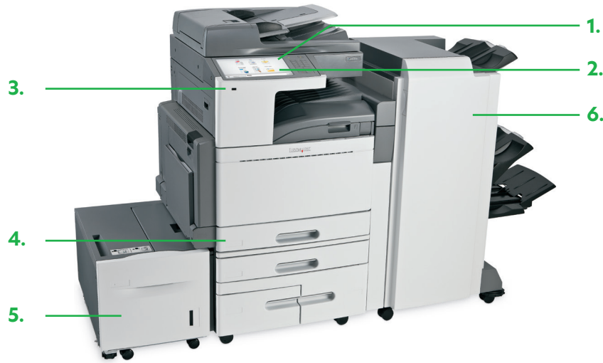
Lexmark XS955dhe color MFP with optional booklet finisher and 2,000-sheet high capacity feeder