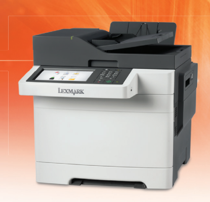
Up to 32 ppm