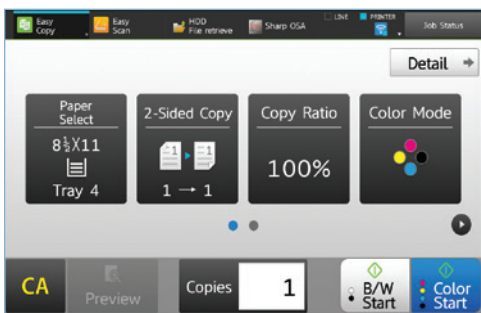
Easy Copy Screen offers the most commonly used settings.