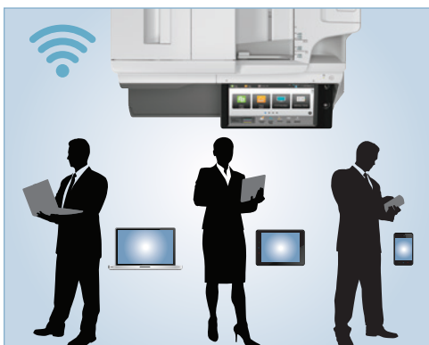
Built-in wireless network interface for convenient scanning and printing from mobile devices.

From paper handling to networking, the MX-3070N, MX-3570N, and MX-4070N color Advanced Series will exceed your expectations.