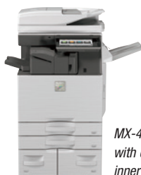
MX-4070N shown with compact inner finisher.

When it's time to get the job done, the Advanced Series color document systems are outstanding performers. Quickly scan documents at speeds up to 200 images per minute . Built-in optical character recognition (OCR) can convert your scanned documents into text-searchable PDFs or Microsoft Office file formats, simplifying your workflow. Use the manual stapling feature on select finishers to restaple your originals. Multiple finishing options give you the output you require, be it stacked, stapled, or saddle-stitched. There's even an available built-in stapleless staple feature, which can bind up to five sheets of paper by adding a crimp to the corner of the set, saving regular staples for larger sets.