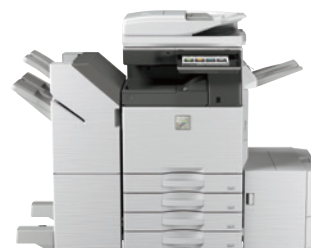
MX-4070N shown with 3K saddle stitch finisher and large capacity cassette.