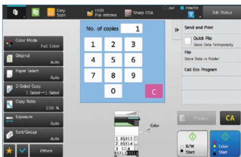
Standard Copy Screen offers more advanced features.