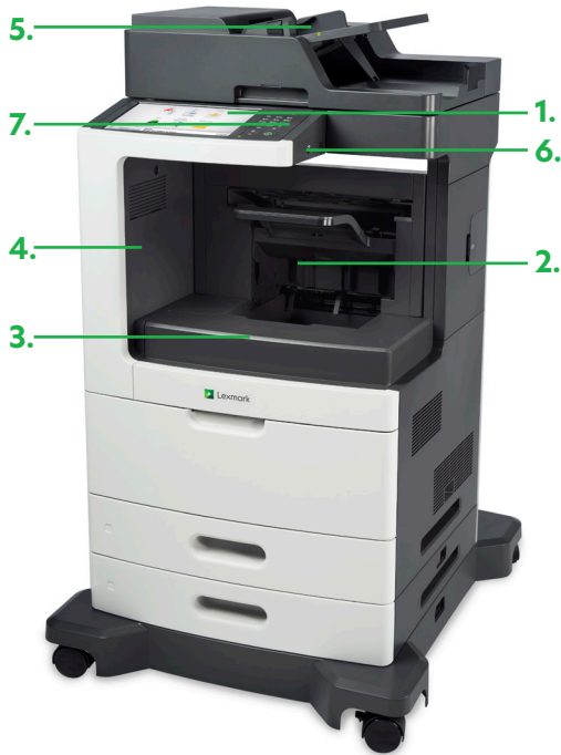
XM7263 model configured with Staple, Hole Punch Finisher